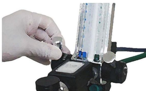
Step 7: Adjust N2O (nitrous) flow rate to desired level.