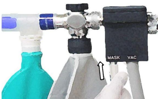
Step 3: Connect the end of the NITROUSEAL Circuit exhalation limb to the nipple marked "MASK" underneath AVS module.