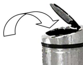
Step 8: Dispose of NITROUSEAL Circuit and NITROUSEAL Mask after each single use.