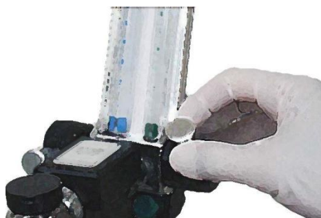
Step 5: Adjust O2 (oxygen) flow rate to desired level.