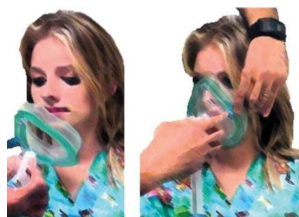
Step 6: Apply the NITROUSEAL Mask first by placing under the chin then resting it snugly over the nose and mouth. Make sure the sealing cushion is not wrinkled.