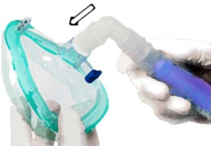
Step 1: Connect NITROUSEAL Circuit to NITROUSEAL Mask.