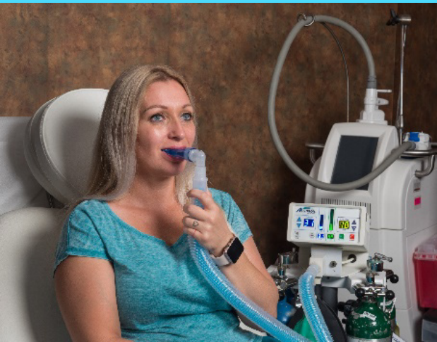
Mouthpiece and Nitrouseal® circuit ideal for procedures around the nose and mouth

The premium and only complete nitrous oxide system available.