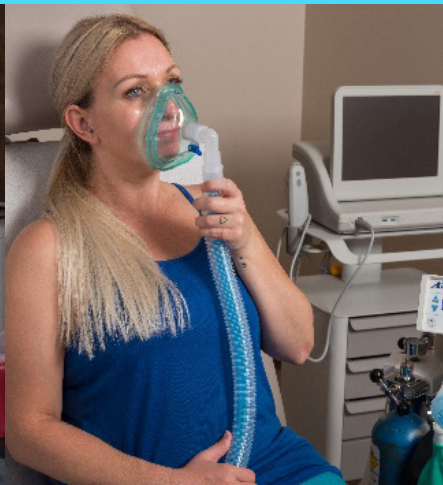
Nitrouseal® mask and circuit ideal for body procedures as well as face and neck